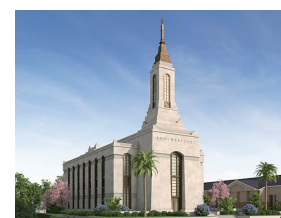
Okinawa Temple (Exterior Rendering)